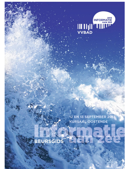
Cover "Informatie aan zee"